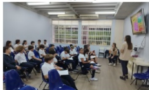
Meeting with WAMUN Jr participants