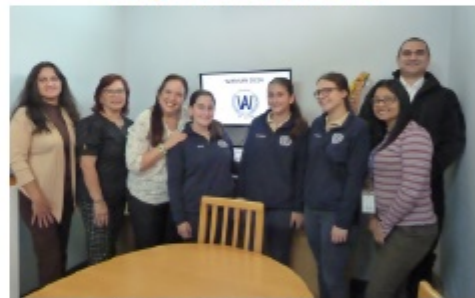
Sponsorship meeting with Mercantil