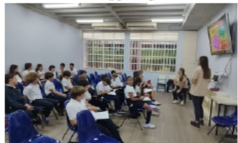
Meeting with WAMUN Jr participants