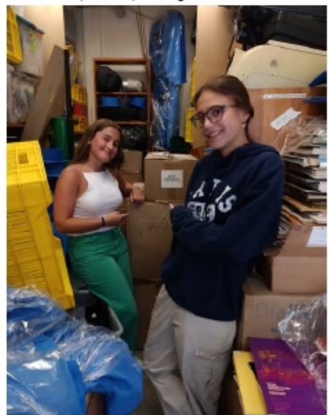
Handing out event materials