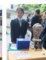
Julián Álvarez Simón Bolívar