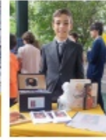
Ignacio Capellán Antonio Guzmán Blanco