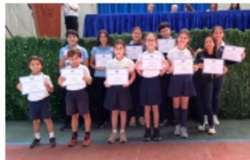
Outstanding Work Habits