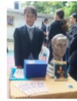
Julian Álvarez Simón Bolívar