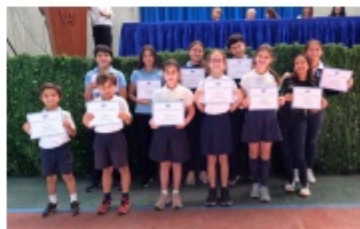
Outstanding Work Habits