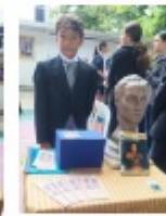
Julian Álvarez Simón Bolívar